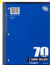
70 page 1 subject spiral notebook